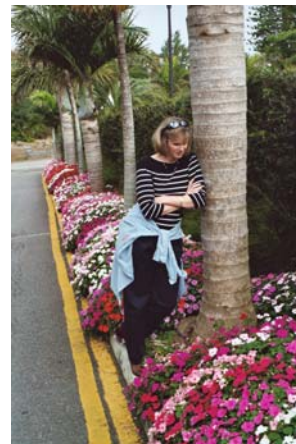
"Why don't my impatiens look like these?"