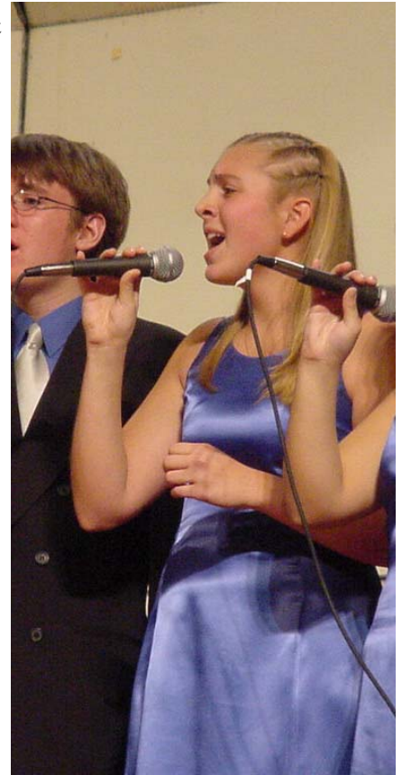
JL in Solvay High School Vocal Jazz Ensemble