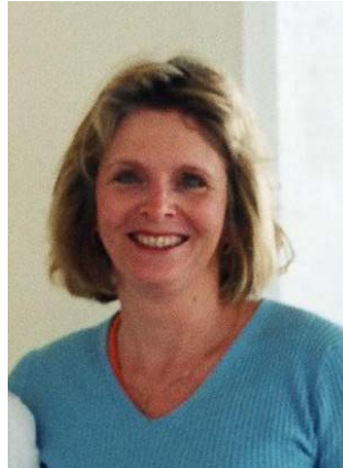
Wife of the Year 2003*