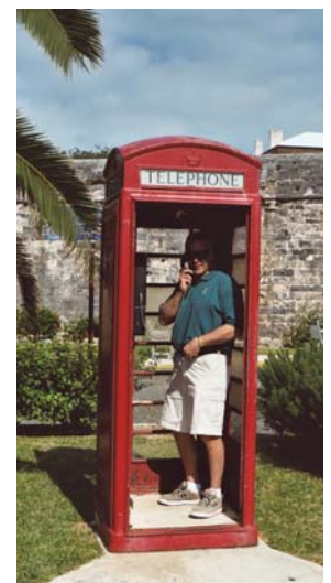
"Kids, we've decided not to come home, ok?"